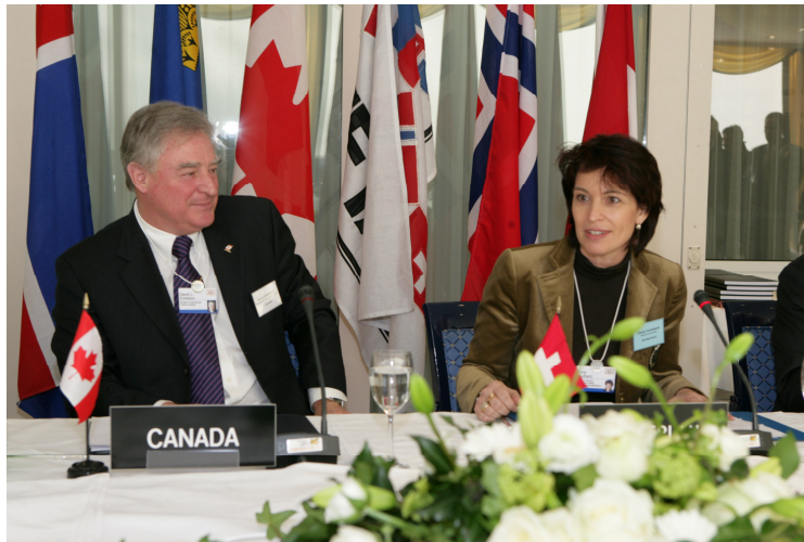
Swiss Federal Councillor Doris Leuthard with the Canadian Minister of International Trade David Emerson at the signing ceremony of the FTA in Davos, January 26, 2008. 17

The EFTA-Canada FTA strengthens economic and trade relations between Switzerland, the other EFTA States and Canada and guarantees mutually improved market access. It considerably enhances the network of FTAs established by the EFTA States since the beginning of the 1990s. In terms of trade flows, Canada will be the most important free trade partner of the EFTA States after the European Union.