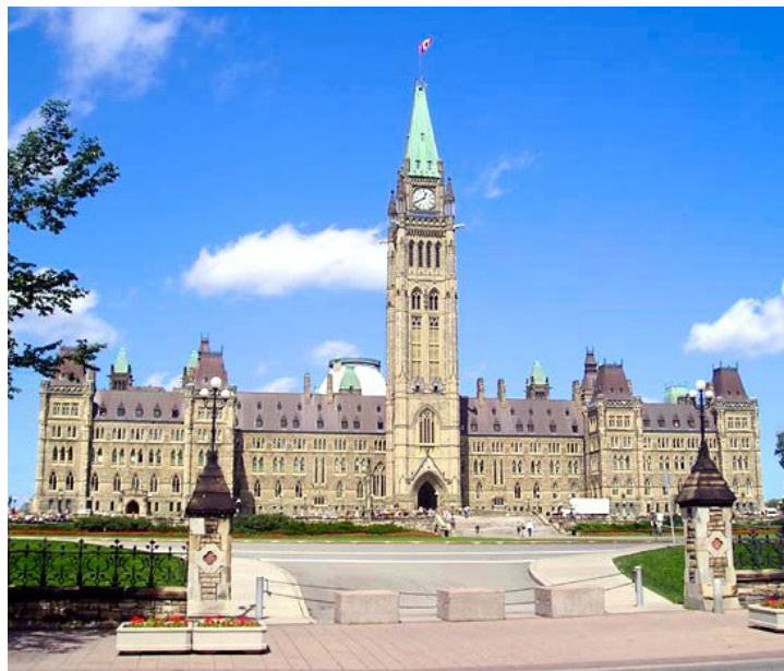
Parliament Hill, Ottawa

In 2006, the Conservative Party, led by Stephen Harper, returned to power after 12 years in the opposition. The new minority government has brought forward through Parliament important legislation such as the reduction of the federal value-added-tax from 7% to 5%, the introduction of new ethics and accountability standards for government, and the Tackling Violent Crime Act. On foreign policy, Harper has set a conservative course, closer to the United States, and with the support of the Parliament extended Canada’s military mission in Afghanistan until 2011. Furthermore, he has been strengthening the Canadian Forces with new equipment, cutting the Foreign Ministry's budget, and increasing Canada’s presence in the Arctic. On the international economic scene, the government has given priority to open up important foreign markets and diversify export possibilities i.a. with free trade and cooperation agreements. This new policy orientation provided a strong stimulus to the EFTA-Canada FTA, which was signed in early 2008, after the negotiations had been suspended for several years. 6